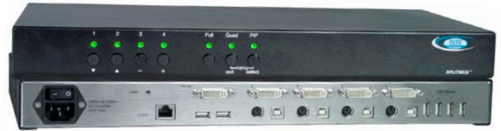
SPLITMUX-DVI-4 (Front & Back)

The SPLITMUX® DVI/VGA Quad Screen Multiviewer allows you to simultaneously display video from four different computers on a single monitor. Additionally, it can switch one of the four attached computers to a shared keyboard and mouse for operation and to four additional USB devices.