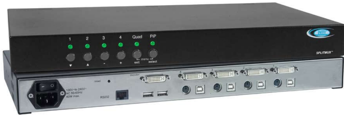
SPLITMUX-DVI-4 (Front & Back)

Simultaneously display video signals from four different video sources on a single screen